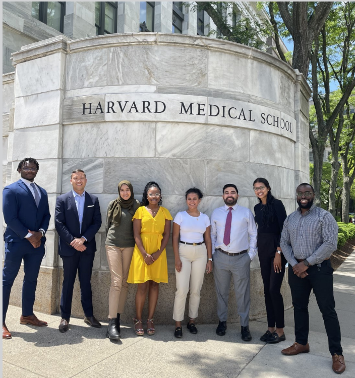
The Harvard Medical School Office for Diversity Inclusion and Community Partnership and the Harvard Catalyst Diversity Inclusion Program