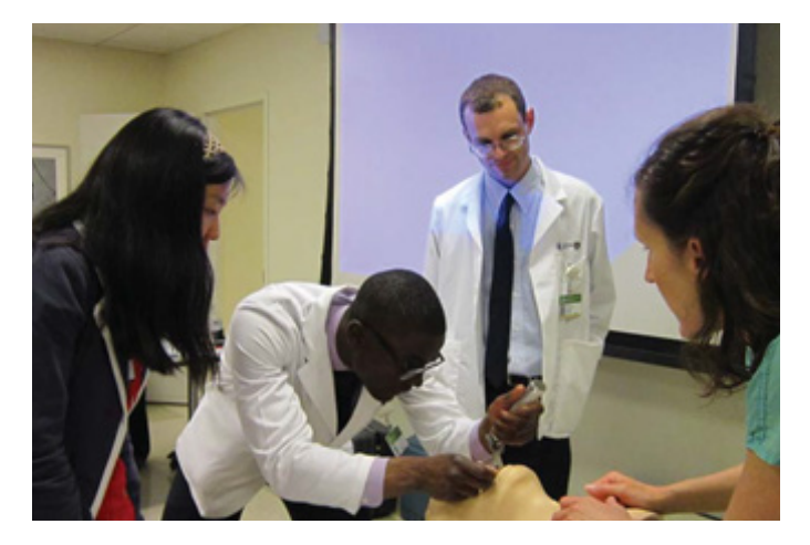
Harvard-affiliated programs at Brigham & Women's and Massachusetts General Hospitals.

In March, 2019 Beth Israel Deaconess Medical Center and Lahey Health officially combined to form Beth Israel Lahey Health, the second-largest health system in Massachusetts. The medical education program at BIDMC is both strong and deep, with over 80 training programs for interns, residents and fellows; several of these are integrated with other